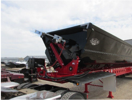
Hydraulic Reservoir on Trailer