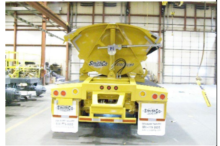
Strobe Light Bar