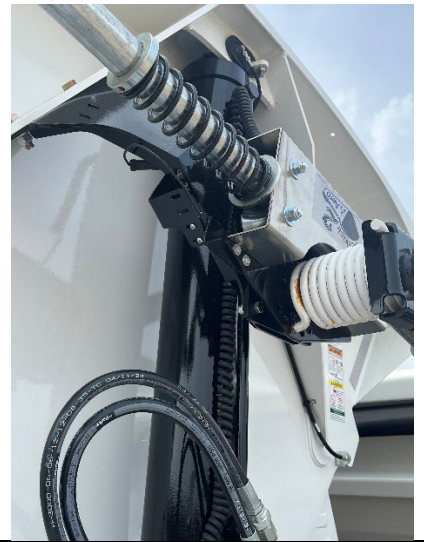
Tarp Lockout Sensor