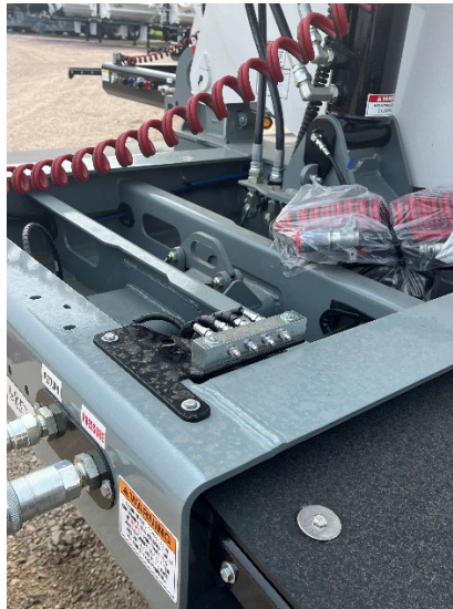
Remote Grease 5 th Wheel