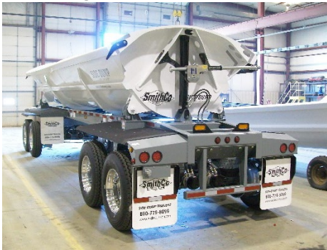
Strobe Light Mount