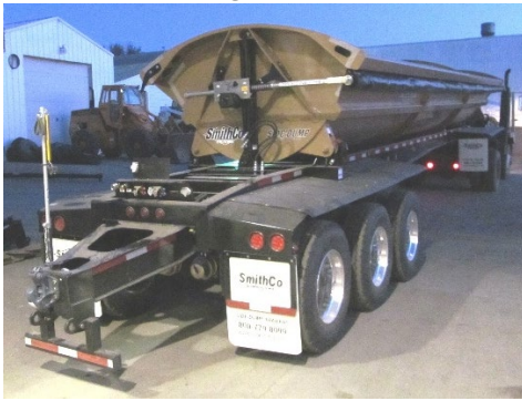
Pintle Hitch Stinger