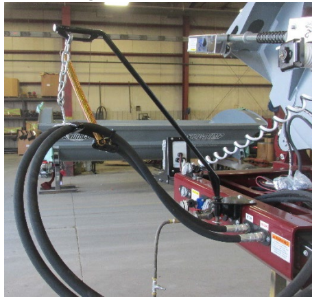
Swivel Pogo Stick F03478