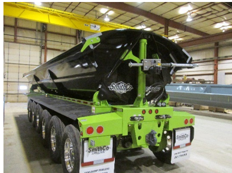
Pintle Hitch Block