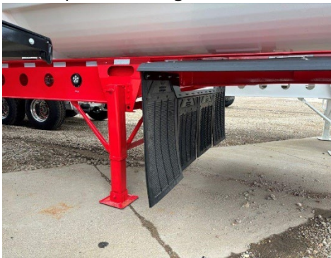
Mudflaps at Landing Gear